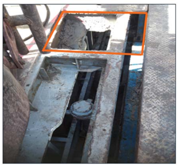
Figure 2 - Original position of the plate