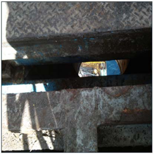
Figure 3 - Gap in rotary where plate fell through