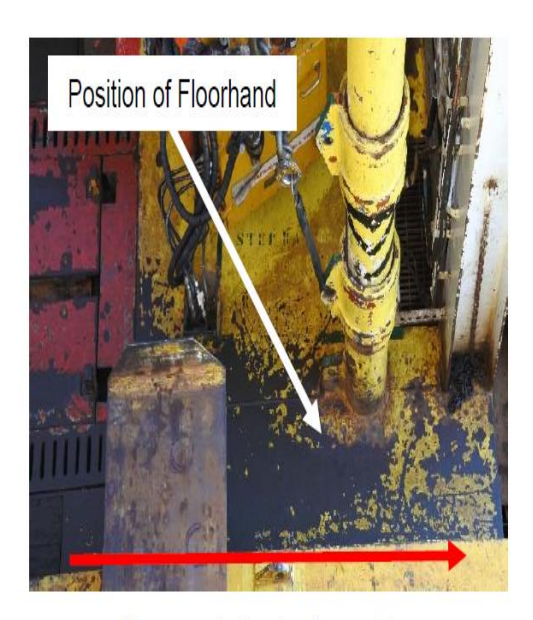
Movement of catwalk machine