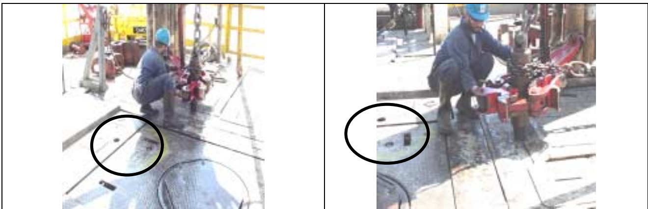
Black circle is point to spider elevator place beside well hole

While running 13 3/8" casing, the company man requested the fill line length to be extended. The casing company did not have the proper joints available, so it was decided to add a Kelly valve to the Kelly. The top drive was put in the extended position to clear the well hole, which contained the casing. Spider elevator was placed beside the well hole. The extension was placed on the rig floor and not in the mouse hole due to it being covered and not available. The crew was attempting to hold onto the fill line arrangement with the air hoist line and chain sling on one side and supported on the other side by the left side (back up tong) rig tong. The IP was placed in between the left rig tong and the spider elevator to support the tong while make up torque was applied. Due to make up torque from the top drive, the fill line arrangement and the left rig tong moved toward IP who was trapped by the spider elevator and struck him in his right arm causing a fracture.