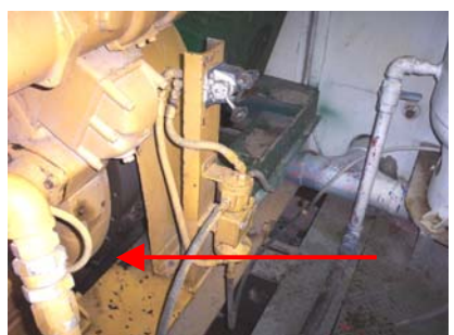
Original clutch assembly guard allowing access to Fly wheel and clutch.

Employee was directed to clean the pump engines as part of his work assignment for the night. He wiped down the #2 pump engine without incident. #2 pump was not on the hole and the engine was shut off at the time. Employee then began cleaning the #1 pump engine while it was running. He was wiping the skid near the rear motor mount when he got too close to the rotating clutch assembly and cut the top of his hand and fingers. Employee stated that just before the accident, the rotating clutch had snagged his wiping rag and shredded it instantly when he got too close to it. He was going to write a "near miss" about it as soon as he went to the doghouse, but continued working and a few minutes later got his hand too near the clutch again and injured his hand. Broken bone in middle finger and lacerations requiring stitches. Employee was released to light duty.