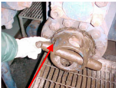
Potential Pinch Point