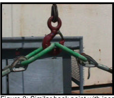
Figure 2: Similar hook point with incorrect sling angle = hazard.

CORRECTIVE ACTIONS: To address this incident, this company provided the following guidance: