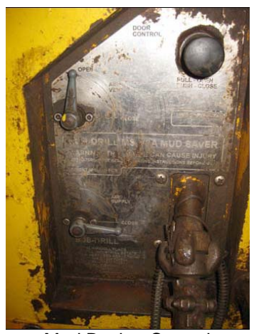
Mud Bucket Control

The Corrective Actions stated in this alert are one company's attempts to address the incident, and do not necessarily reflect the position of IADC or the IADC HSE Committee.