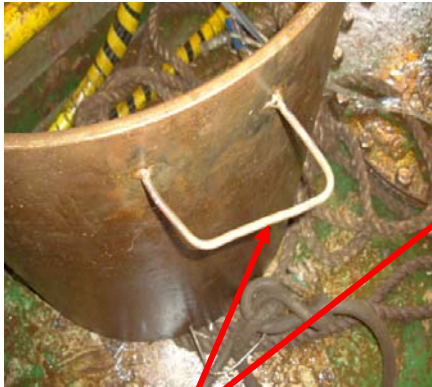
Lifting handle that the cable was attached to.

Although there was a spotter with UHF radio in the moon pool area and a spotter at the rotary table to signal the winch operator, as the guide collar segment entered the rotary table, it caught on the diverter housing. The handle broke off and the 25 kilogram guide collar fell and struck the moon pool equipment support beams then fell into the water. Since personnel had been evacuated from the drop zone, there were no injuries.