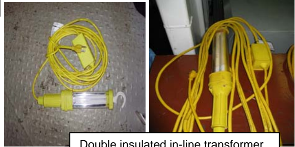
Double insulated in-line transformer.