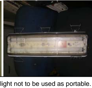
Permanent fixed light not to be used as portable.