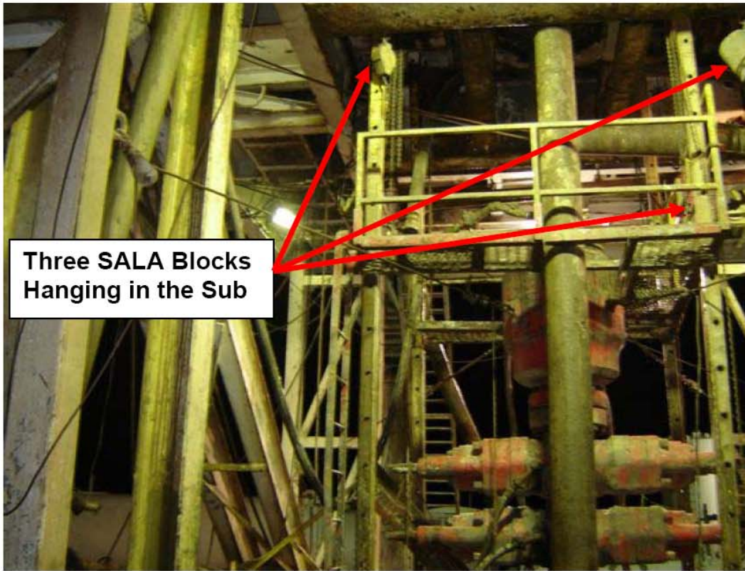
Three SALA Blocks Hanging in the Sub

From the International Association of Drilling Contractors