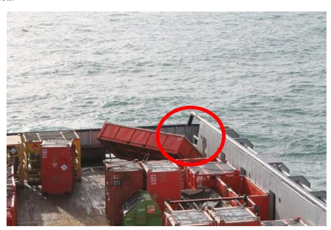
The Corrective Actions stated in this alert are one company's attempts to address the incident, and do not necessarily reflect the position of IADC or the IADC HSE Committee.